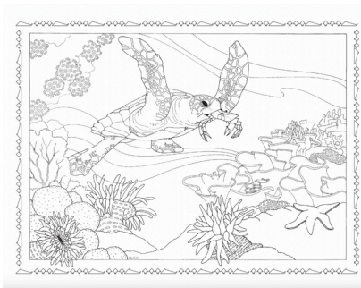
Coloring page for Haggan Tasi Siha/Sea Turtles published by the University of Guam Sea Grant and available for download at http://bit.ly/uogsgturtlecoloringbook